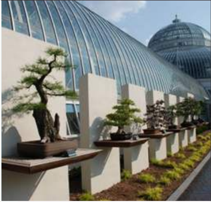
Bonsai Pavilion (seasonal)