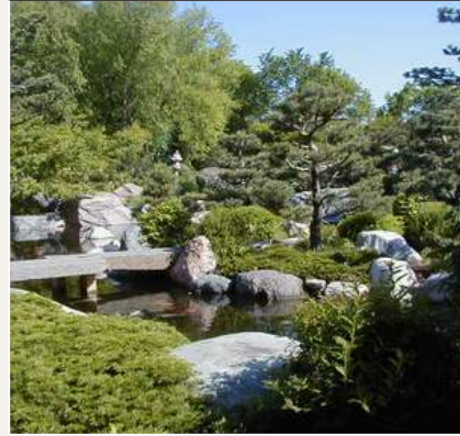
Japanese Garden (Seasonal)