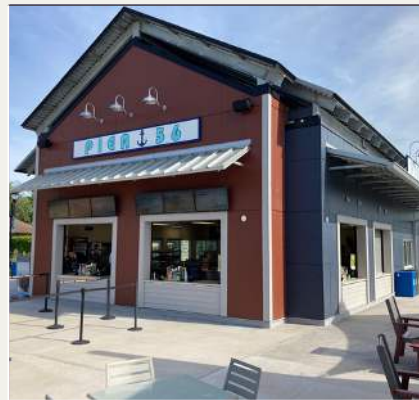
Pier 56 (seasonal)