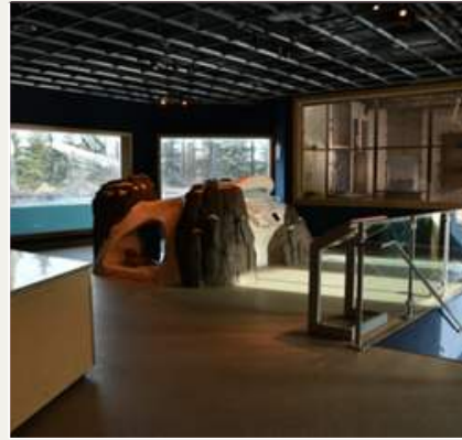
Polar Bear Odyssey